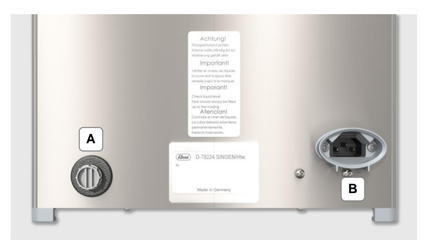
Illustration 4.6 Unit back view (as delivered)