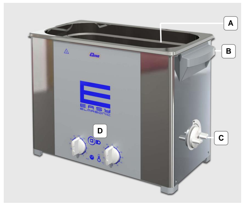
Illustration 4.5 Front view / side view Elmasonic EASY 30 H