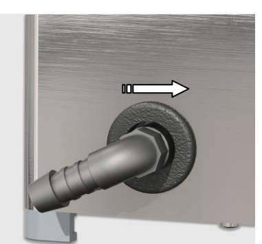
Illustration 5.1.1 Drain with plastic screw cap